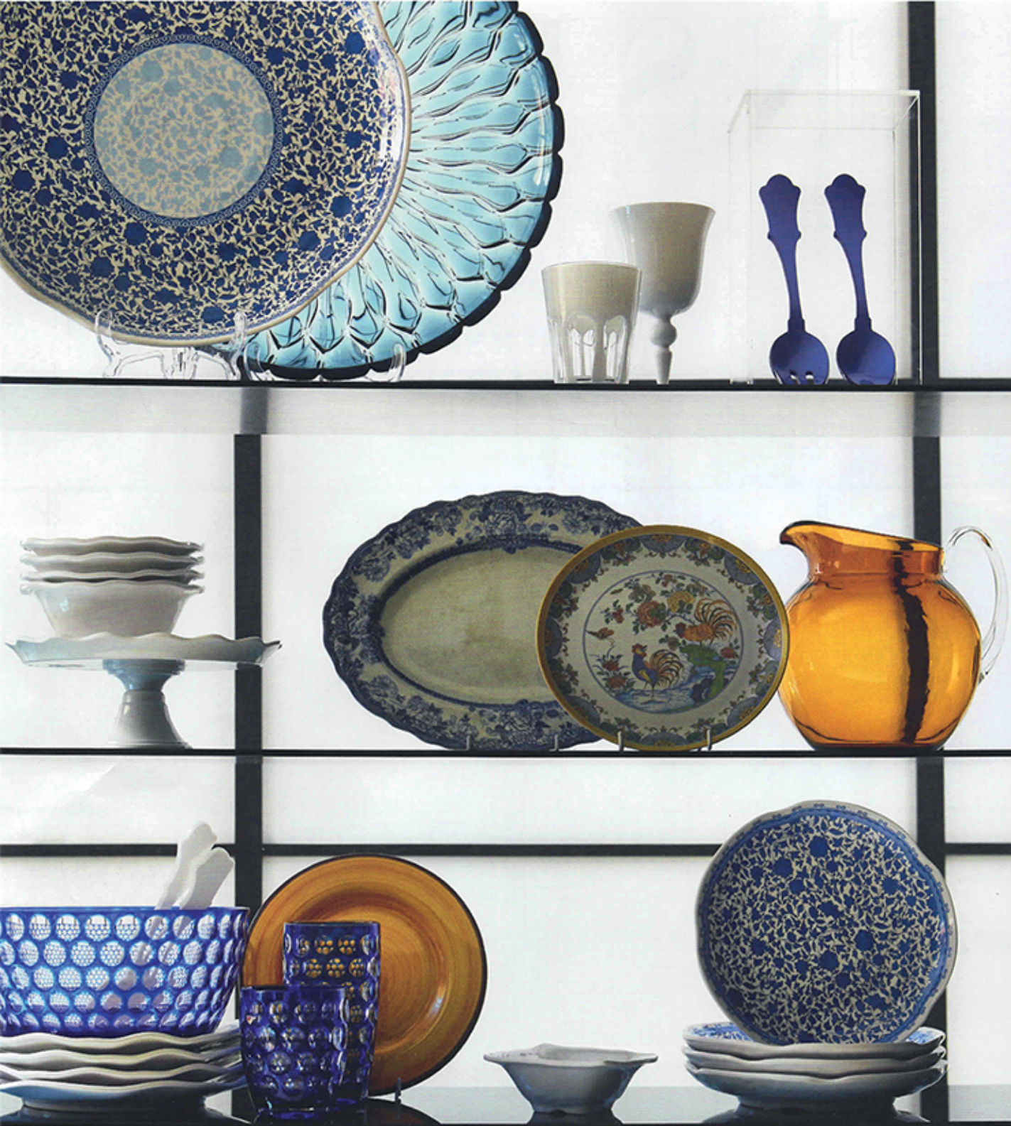
Top row from left Melamine 'Heritage 16" Round Platter', £38, from Nina Campbell. 'Jelly' technopolymer thermoplastic centre plate (blue), by Patricia Urquiola, £74, from Kartell. 'Double Face' acrylic salad set (white), €16; 'Saint Moritz' acrylic wine glass (white), €16; both from Mario Luca Giusti. 'Old Fashioned Lapis Blue' acrylic salad set, £30, from Nina Campbell. Middle row from left 'Ruffle' melamine cereal bowls, £8.50 each, from Nina Campbell. Melamine cake stand, by Host, £11.99, from Wayfair. 'Dovecote' melamine platter, £12.50, from Marks & Spencer. 'Farm' melamine plate, £6, from Bonnie & Bell. 'Palla' acrylic pitcher (amber), €51, from Mario Luca Giusti . Bottom row from left 'Lente' acrylic salad bowl (blue), €56, from Mario Luca Giusti. 'Ruffle' melamine dinner plates, £14.50 each; 'White' acrylic salad set, £30; all from Nina Campbell. 'Lente' acrylic tumblers (blue), €14 and €17, from Mario Luca Giusti. 'St Tropez' melamine fruit plate (yellow), £20; 'Ruffle' melamine bowl, £5; 'Heritage' melamine plates, £17.50 each; all from Nina Campbell. Shelves in 'Silvered Mirror' glass (cobalt), £230.40 a square metre, from Preedy Glass